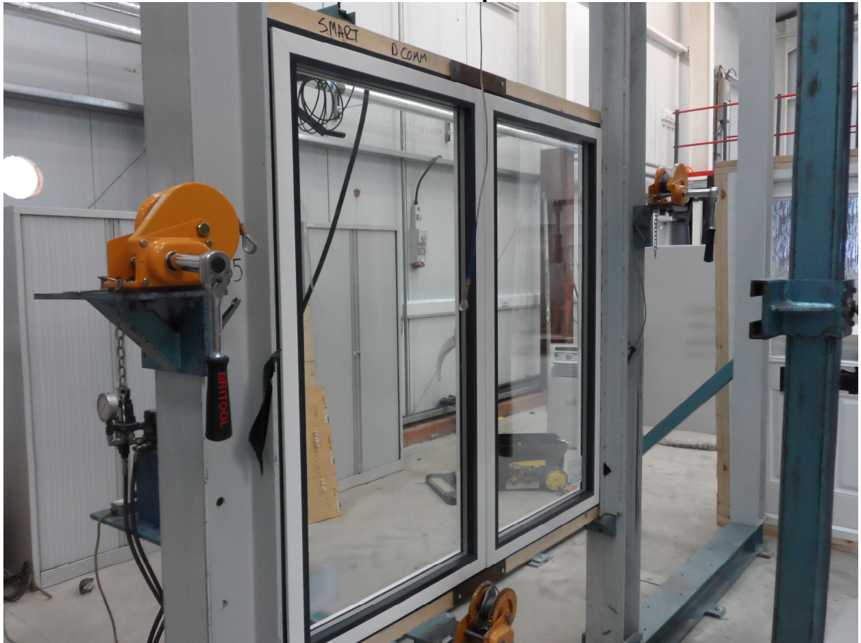
Photo of sample